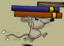
Sam & Friends

Academic Success for All Learners is making a difference in classrooms just like yours and in some of the toughest learning environments around the globe. Our programs will make a difference in the reading abilities and confidence of your learners. The Reading for All Learners Programs will make a difference in The Five Essentials: (1) phonemic awareness, (2) phonics, (3) fluency, (4) vocabulary, and (5) text comprehension.